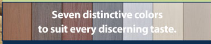
Endeck Capped Cellular PVC Decking

Seven distinctive colors to suit every discerning taste.